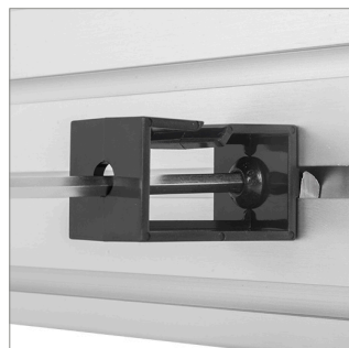
All mounting hardware included