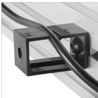
Easy access clip can hold multiple cables, ideal for multi screen installations