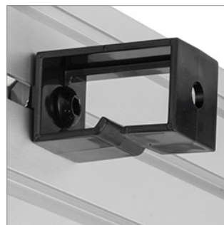
Can be positioned anywhere along the mounting rail, including underneath