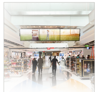
System X compatible