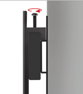
Arms feature levelling screws to adjust the screen height