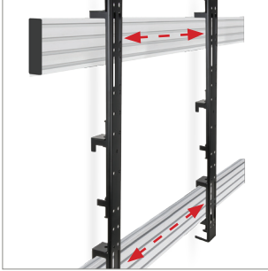
Position arms anywhere along the length of the rail