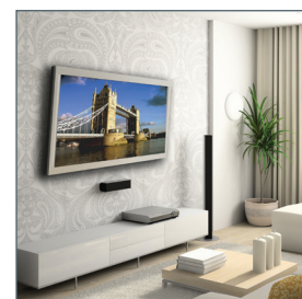
Cable management clip for clean and tidy installation