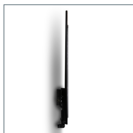
Low profile design mounts screen only 44mm (1.7") from wall