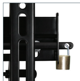
Locking bar for secure installation*