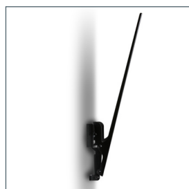
5 fixed tilt positions up to +15°