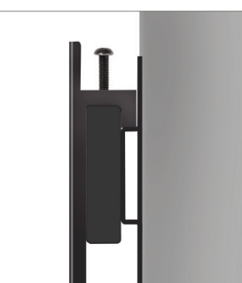
Arms feature levelling screws to adjust the screen height

wall, allowing easy access to connectors