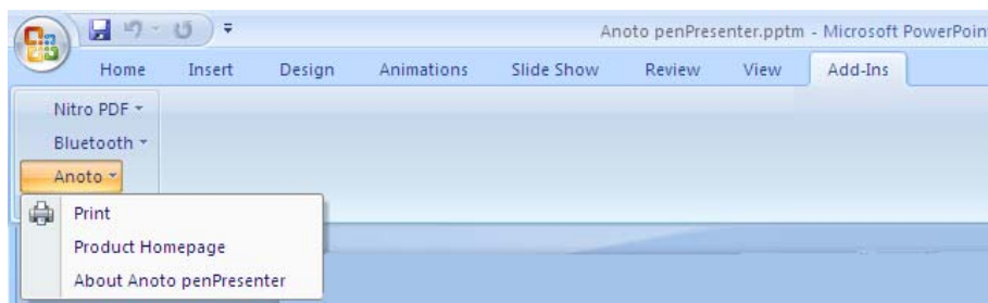
The Anoto penPresenter menu in PowerPoint 2007.

In addition to Anoto penPresenter, the programs Microsoft .NET Framework 2.0 and ImageMagick® 6.3.6 are installed on the PC (if not already installed). Ghostscript is included in Anoto penPresenter and thus also installed.